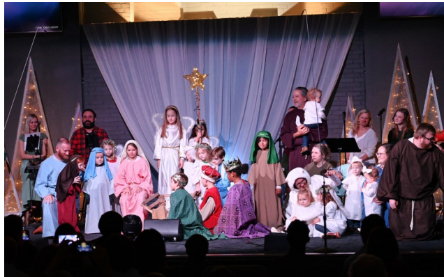
KIDS CHRISTMAS PAGEANT

Find us online at stillwaterchurch.com and Facebook. Email us at info@stillwaterchurch.com .